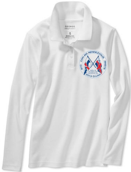
Long Sleeve Polo Shirt Price: $42 (est.)