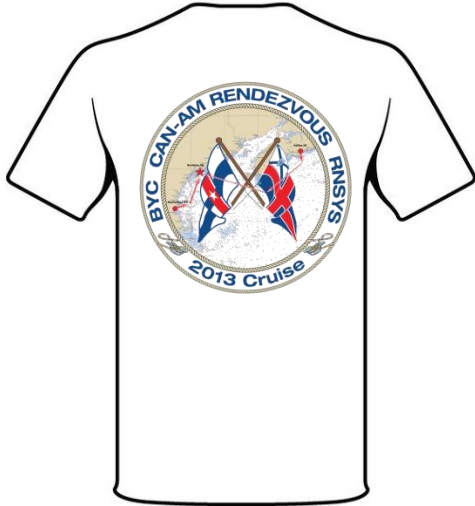
Short Sleeve T-Shirt Price: $18 (est.)