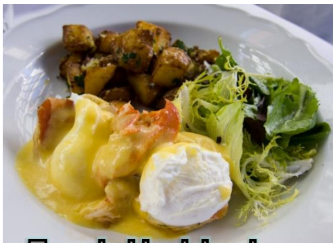
Fresh Haddock with Lobster Hollandaise