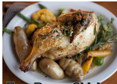
Free Range Chicken with Herbs & Sage Aioli