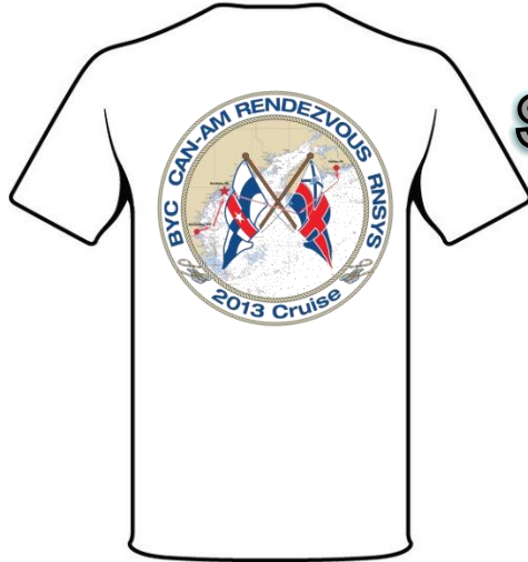
Short Sleeve T-Shirt Price: $18 (est.)