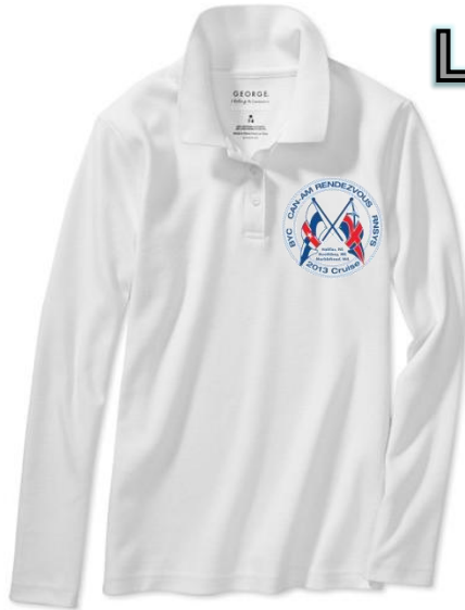
Long Sleeve Polo Shirt Price: $42 (est.)